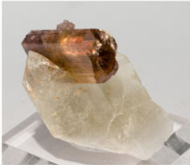
Liddicoatite - Madagascar 4.8 x 3.3 cm.