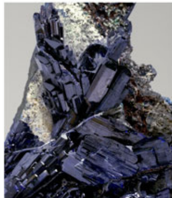
Azurite - Tsumeb, Namibia 11.8 x 7.8 cm.