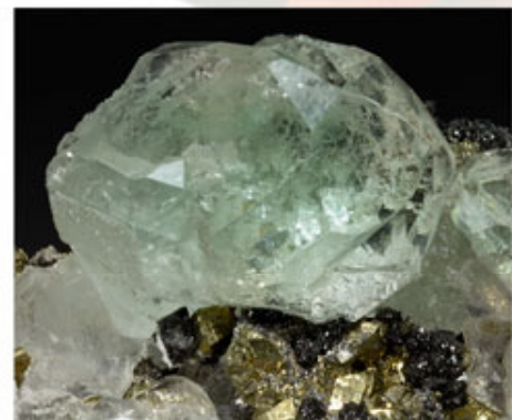
Fluorite - Huanzala Mine, Perú 15.4 x 9.8 cm.