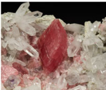
Rhodochrosite - Wudong Mine, China 10.9 x 6.3 cm.